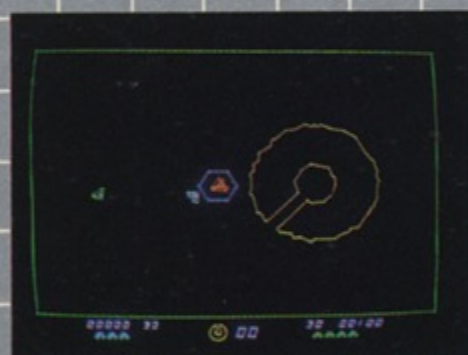
Protected from energy bolts, Eliminator leaves the Base.

Dimensions Upright: 71 1/4" high, 29 7/8" deep, 25 15/16" wide, 330 lbs. Cocktail: 25 1/8" high, 23 15/16" deep, 35 3/4" wide, 165 lbs.