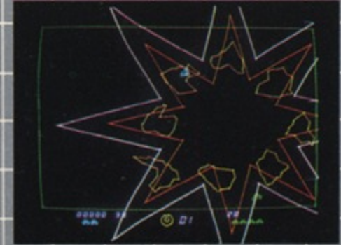
A well-aimed shot through the tunnel explodes the Eliminator Base.

M ake room for Eliminator™. Eliminator is the hot new game from Sega/Gremlin that's already climbing to the top of many earning reports. You can't afford to be without it.