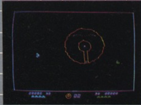
Players battle each other while Eliminator gains energy.