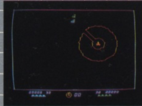
Player ships positioned to shoot through tunnel leading to Eliminator.