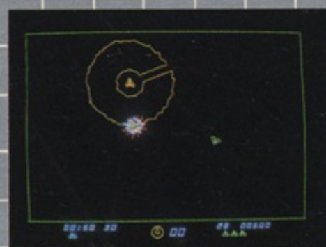
Destroy your opponent's ship by bouncing it into the Eliminator Base.

firing an energy bolt directly down the tunnel. Higher scores can be earned by destroying the Eliminator Base in the same manner after the Eliminator Ship has emerged from its base. Either way, the base is destroyed in a spectacular explosion of sound and color — the round is ended and another more difficult round begins.