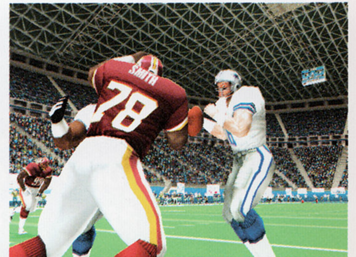
Online sports won't get much better than NFL 2K1

You can sign up for the service either online at www.sega.com , or at your local retailer.