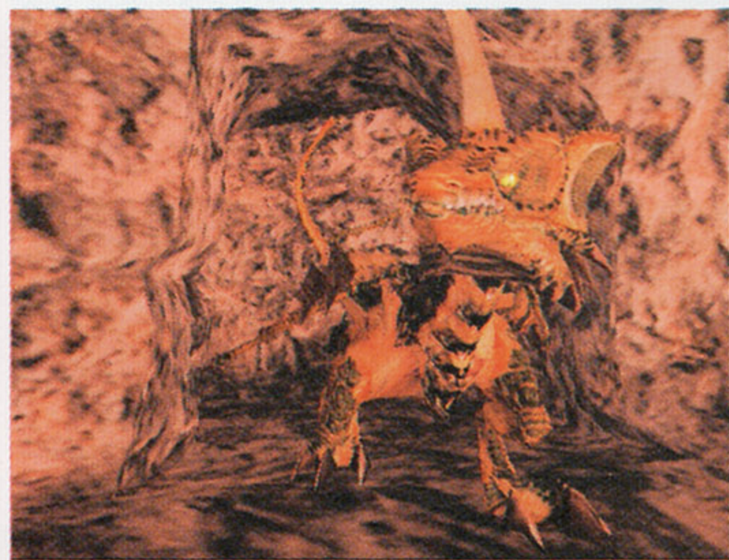
Phantasy Star Online is going to be a fantastic experience

be totally painless for retailers. You can continue selling Dreamcasts as you always have — but with a great new sales pitch! — and Sega handles the rebate. In conjunction with the rebate announcement, Sega also announced the first multiplayer