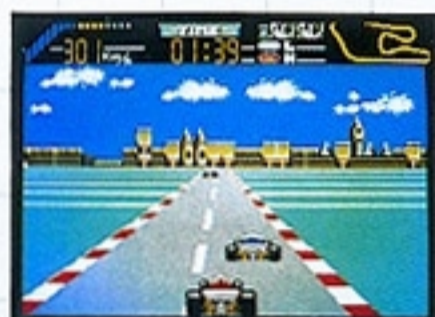
World Grand Prix™ Race the hottest cars in the world. On the hottest tracks in the world. And if that's not enough excitement for you, then build and race on your own track.