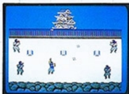
The Ninja™ Throughout your journey to the Ohkami Castle, you'll battle evil Ninja Warriors. Once there, you must destroy their leader, Gyokuro. Only then will you be able to save the princess from her prison inside the castle.