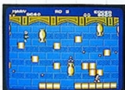
Quartet™ Destroy all of the enemies and recapture the lost treasure from the space colony. You can play two at a time in this action adventure.