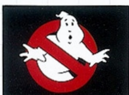
Ghostbusters™ Pursue the ghosts and try to destroy them, but beware of their boss who is laying in wait for you. © 1984 ACTIVISION, INC. GHOSTBUSTERS™ IS A TRADEMARK OF COLUMBIA PICTURES INDUSTRIES, INC.