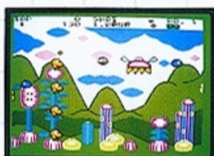
Fantasy Zone™ Capture the coins to buy parts and arms for your spaceship. Advance by destroying one enemy after another!