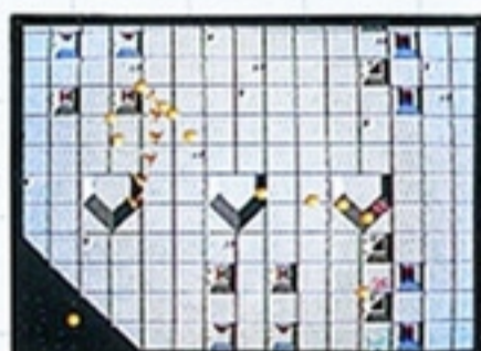
Astro Warrior™ Turn back the invaders and save the galaxy in ASTRO WARRIOR.