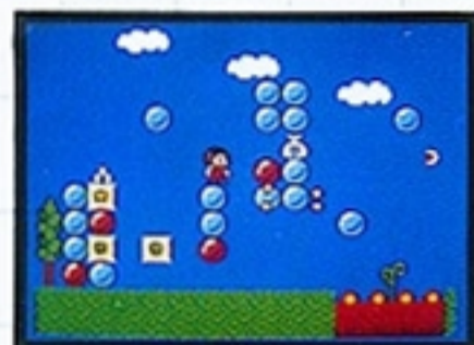
Alex Kidd in Miracle World™ Journey through the planet Aries to the beautiful City of Radactian—and save it from the evil Janken the Great.