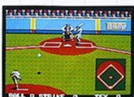
Great Baseball™ Talk about an exciting and authentic baseball game, this one even has relief pitchers and pinch hitters!