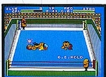
Pro Wrestling™ Step into the ring! Now, you can be a part of the crazy, hard-hitting world of pro wrestling. You'll deliver head-butts, elbow jabs and body-slams and get into out-of-the-ring free-for-alls.