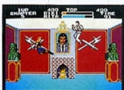
Black Belt™ You're a BLACK BELT master - one of the best - and you'll have plenty of chances to prove it.