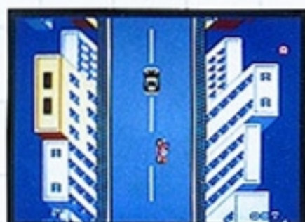
Action Fighter™ Take the motorcycle from "Hang On™" equip it with hi-tech weaponry and give it the ability to transform itself into an aircraft or car and you've got ACTION FIGHTER!