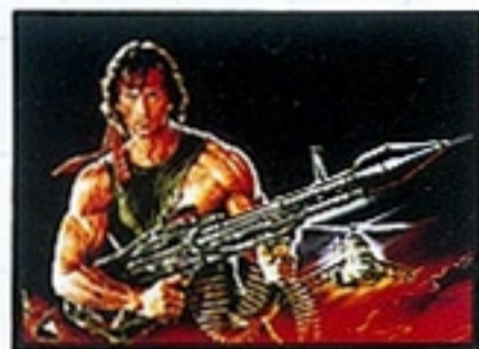
Rambo™ First Blood™ Part II This is a computer game version of the popular film "RAMBO." © 1985 CAROLCO INTL., N.V.

Mega cartridges by SEGA are in a league by themselves. Because each one delivers screen after screen of flashy graphics, wild adventure and countless hours of gameplay.