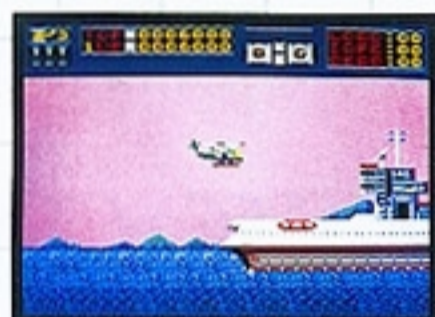
Choplifter™ Rescue the hostages from impending death. On land, at sea and from underground caverns. This game software has been manufactured under license from Broderbund Software, Inc. © Dan Gorlin, 1982