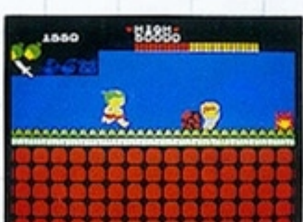
Wonder Boy™ Wonder Boy starts off on a journey to save his girlfriend who was kidnapped by the Great Devil of the Forest. © SEGA/escape 1986