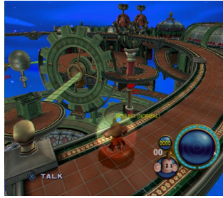
First Pass texturing