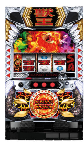
Pachislot Beast King Oujya no kakuse

As we continue evolving Juoh going forward, I want to keep the thrill that the first generation of pachislot machines gave me.