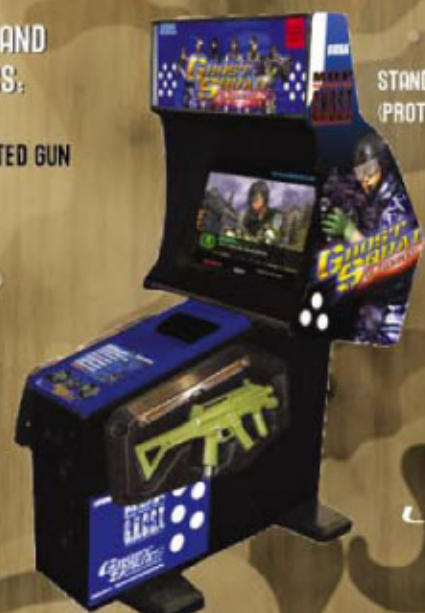
STANDARD CABINET (PROTOTYPE SHOWN)

SEGA AMUSEMENTS USA, INC. 800 ARTHUR AVE. ELK GROVE VILLAGE, IL 60007-8215 TEL: (847) 384-8787 FAX: (847) 427-1078 TOLL-FREE: 1-888-877-8888 http://www.segasega.com