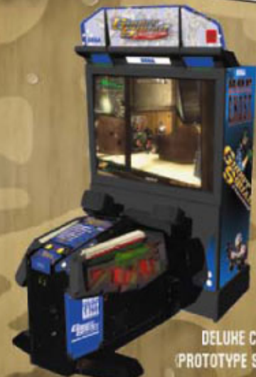
DELUXE CABINET (PROTOTYPE SHOWN)