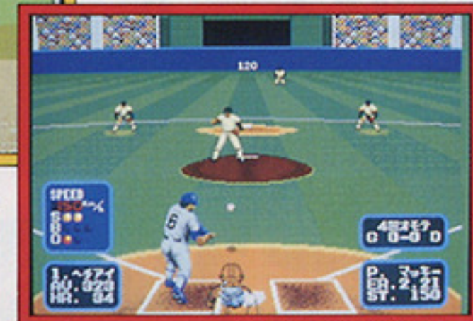
◀ Super League