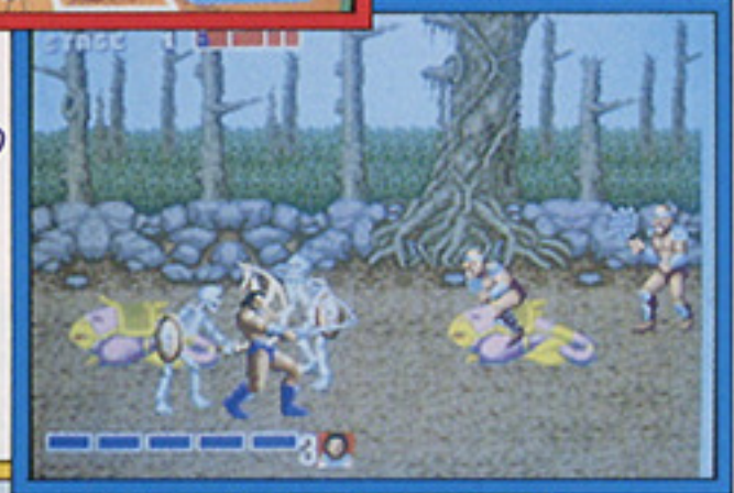
▼ Golden Axe