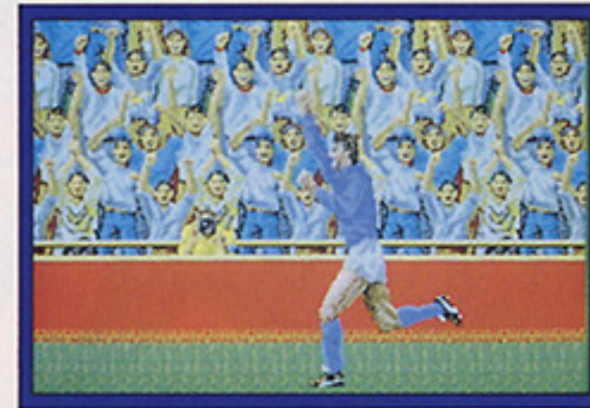
◀ World Championship Soccer