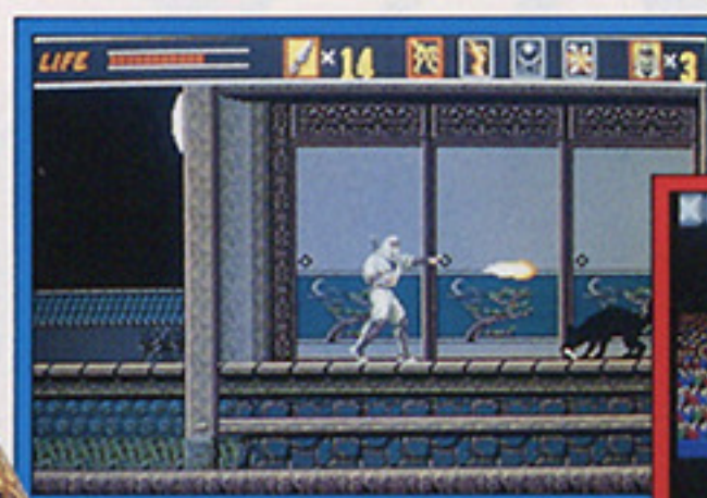
◀ The Revenge of Shinobi