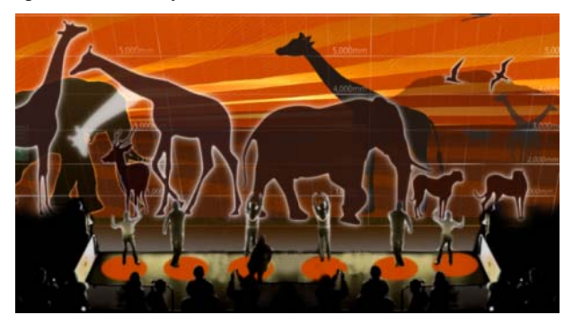
Have fun with a "life-size encyclopaedia of animals" and learn about biology by communicating with life-size projections of animals. Camera recognition sensors allow the exhibition to be enjoyed without touching the screen.