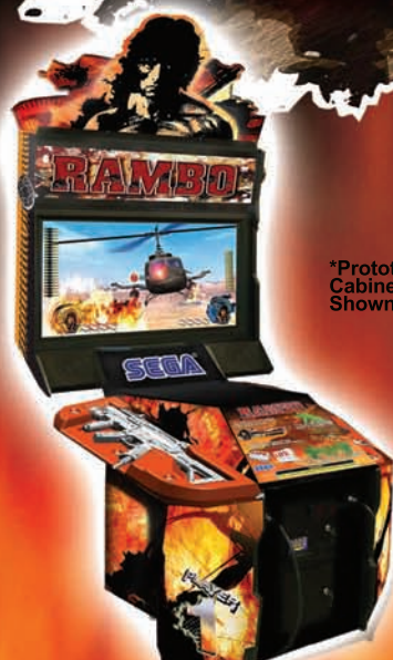
*Prototype Cabinet Shown

BE RAMBO AND UNLEASH YOUR RAGE! THE FAMOUS CLASSIC MOVIES HAVE BECOME A VIDEO GAME