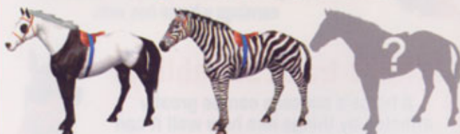
A thoroughbred with Panda markings

A sudden accident? Just think how lucky you'd be if a horse like this appeared out of the blue! You'd really be the center of attention.