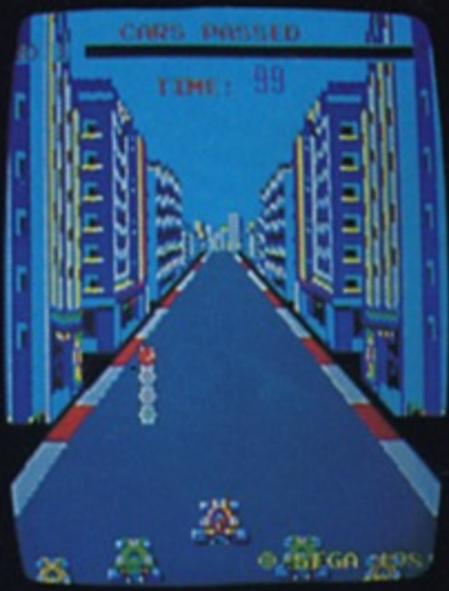
Racers off to a good start.