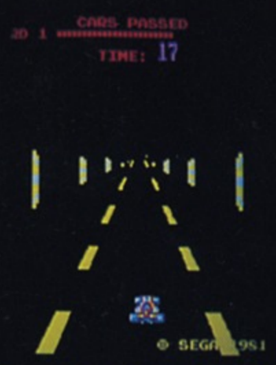
Tunnel vision raceway.