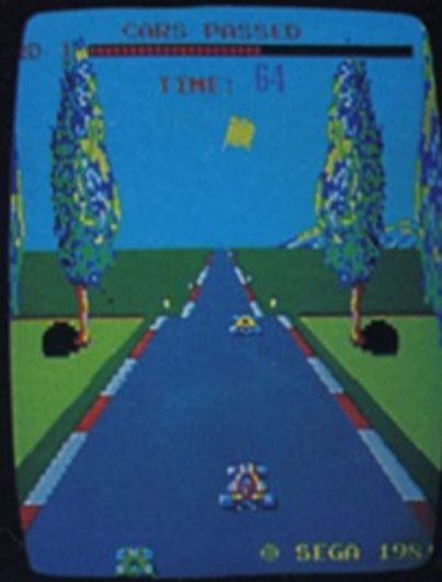
Turbo screeching towards the country.