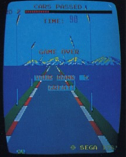
Concluding extended play victory lap.

The aerodynamic Turbo cockpit is fully equipped with an L.E.D. instrument panel that maps acceleration, indicates the top five scores to beat, score of the last game played, and measures record breaking speeds. Standard features include a pro rally steering wheel, responsive 2-speed gear stick shift, illuminated oil and temperature gauges and a full power accelerator, all in the realistic cockpit of a turbo charged race car.