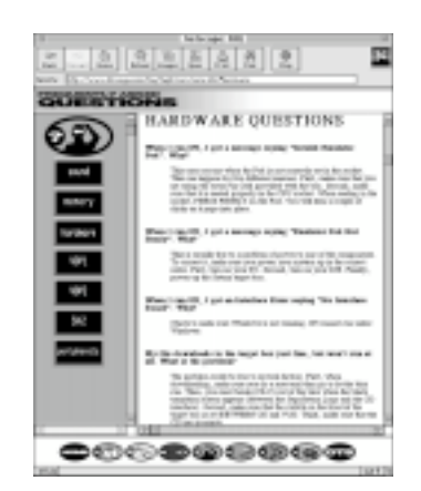
If you hate Frames that much, go ahead and push them out of the way. All frames within the DTS WWW are adjustable .

Not since New Coke and colored contact lenses has a technology been met with such mixed emotions. Yet, here at DTS we have a reason for their use as well as some features that allow for their removal. First, the reason. Considering the amount of information that needs to be distributed to the developer, Netscape Frames were an ideal way to increase navigability and information on a given page. The Sidebar is reserved for late breaking news and important data that needs to be in plain view of the user. The bottom navigation bar is there for the reasons of ease of navigation and convenience. Having these two areas independent of the main area relieves the user from spending most of their time scrolling and sifting through long lists of information.