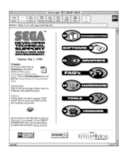
Never consider the DTS WWW finished. Check the front page at least every three days to see what's been added.

have certain security measures in place. The first line of defense is password protection. All developers using the site must be registered with DTS and be issued a username and password. All nonregistered members wishing to have access to the site may submit their pertinent information through the "non-member" area found on the entry page of the site. The second line of defense is the reissuing of passwords and usernames every 90 days. These steps along with a few others that we won't mention will go a long way in ensuring our work along with yours stays secure.