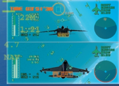
battle head to head in VS mode