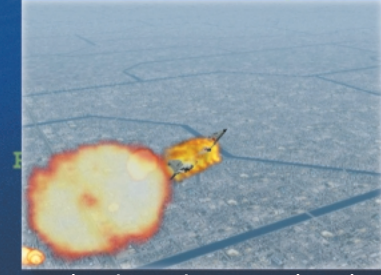
combat intensive, armed to the teeth gameplay